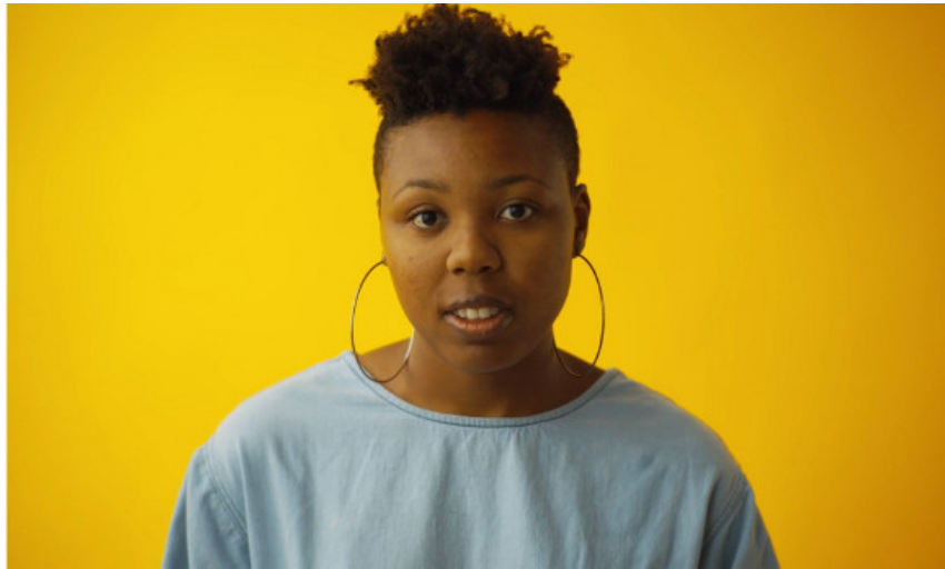
Martine Syms.