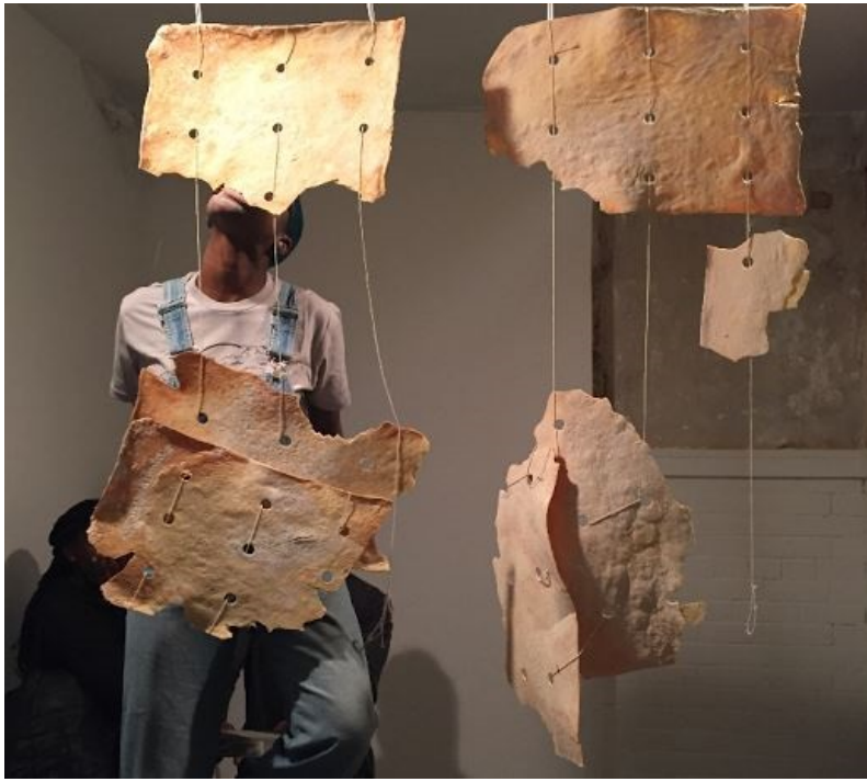
Kenya (Robinson).